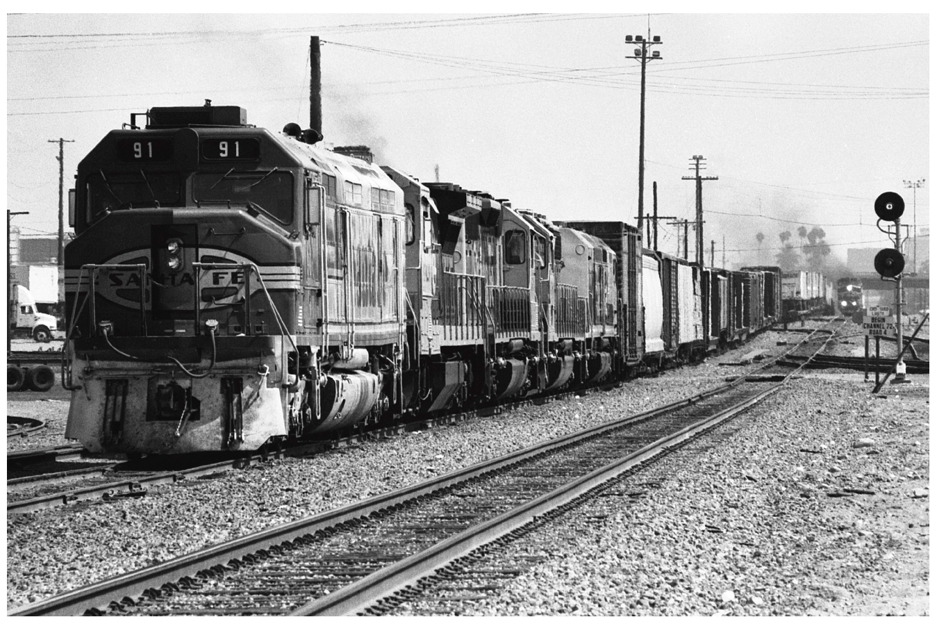
Adorned in its original paint, but wearing its fifth number, ex-101 sets out cars in San Bernardino's A-Yard, 1992.