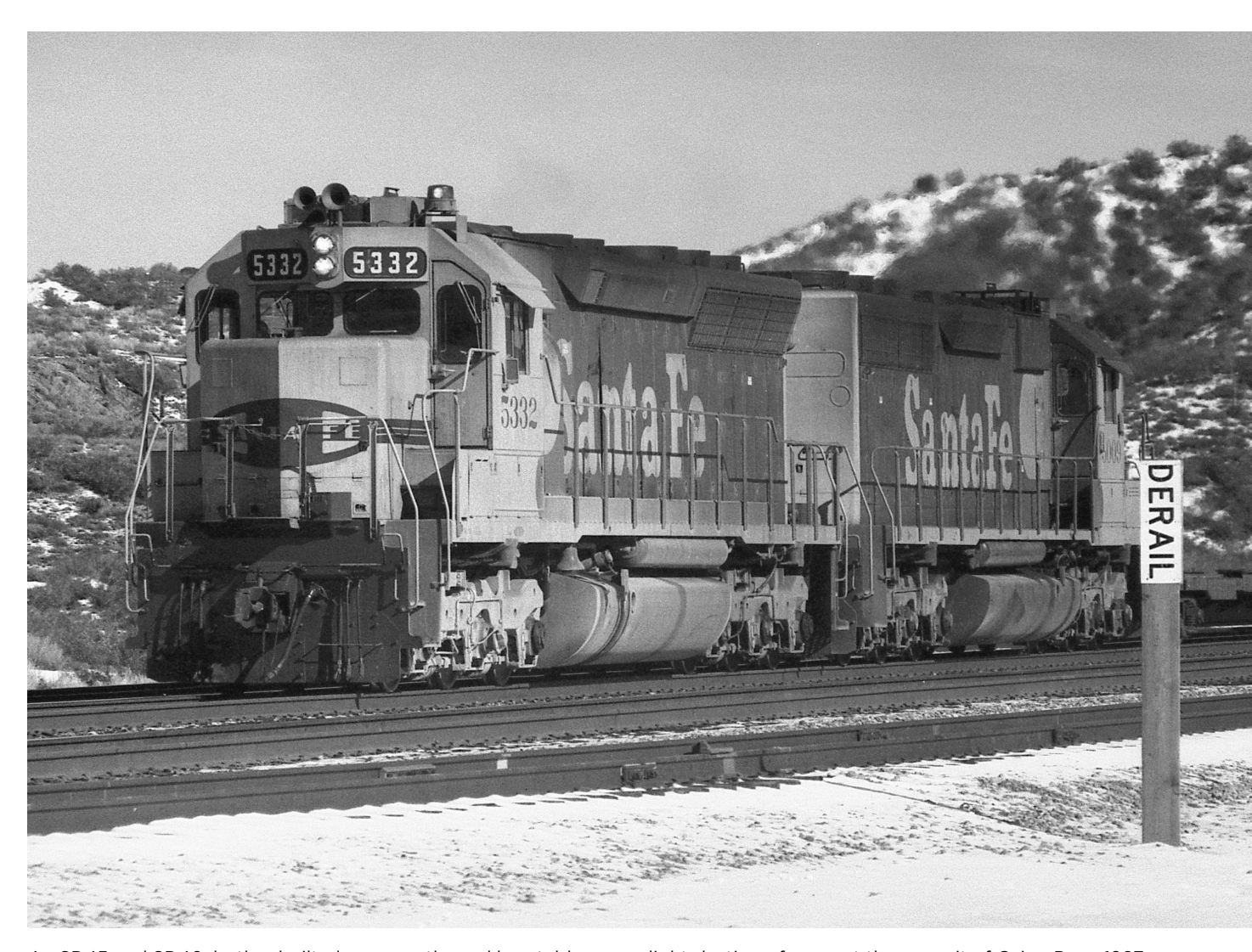
An SD45 and SD40, both rebuilt, drag a westbound baretable over a light dusting of snow at the summit of Cajon Pass, 1987.