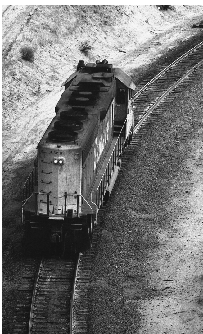
A solitary SD45-2 returns light to Bakersfield from Tehachapi as viewed from atop Tunnel 2, 1984.