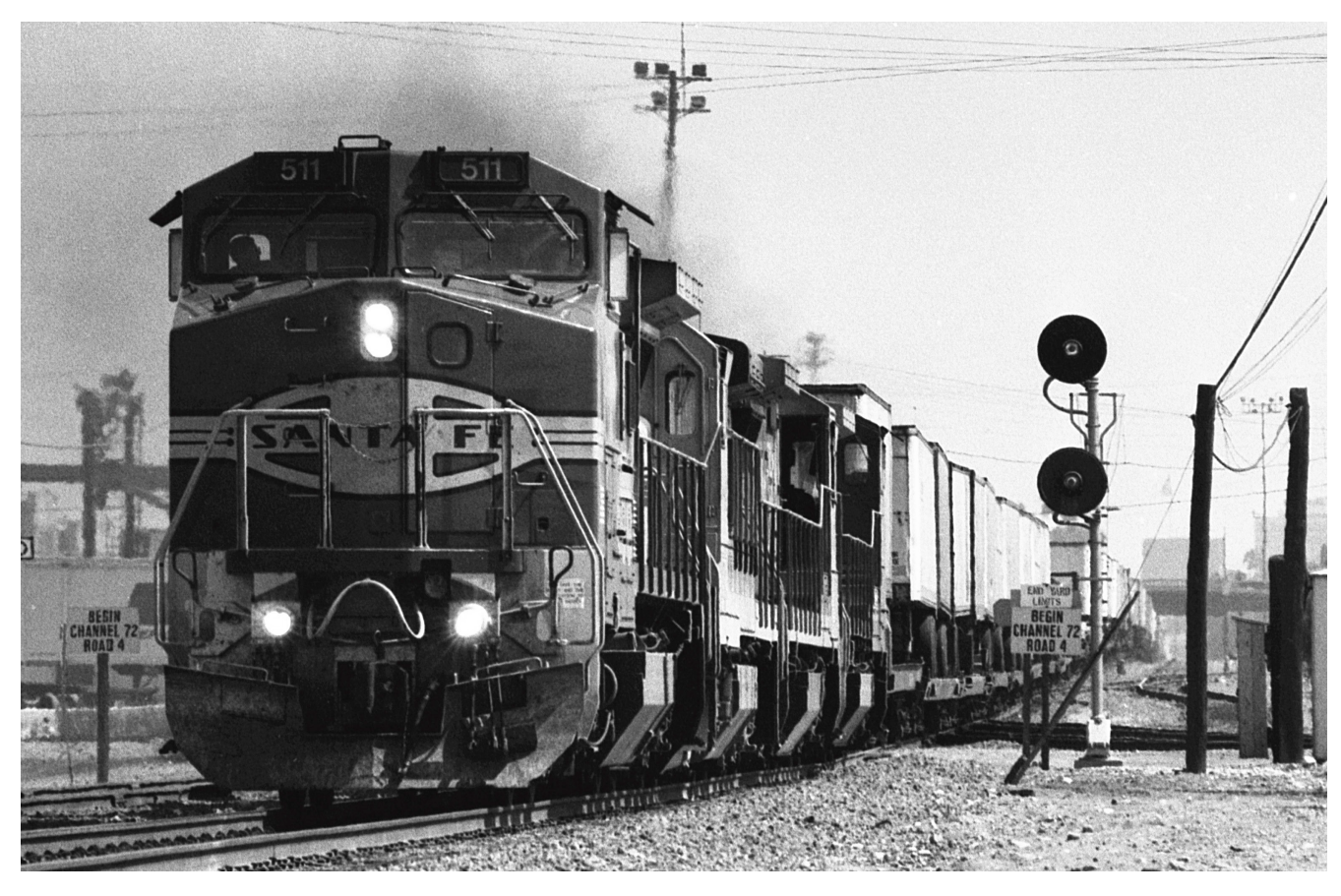
A westbound piggyback behind a mixed quartet of GEs accelerates out the Second District toward Los Angeles.